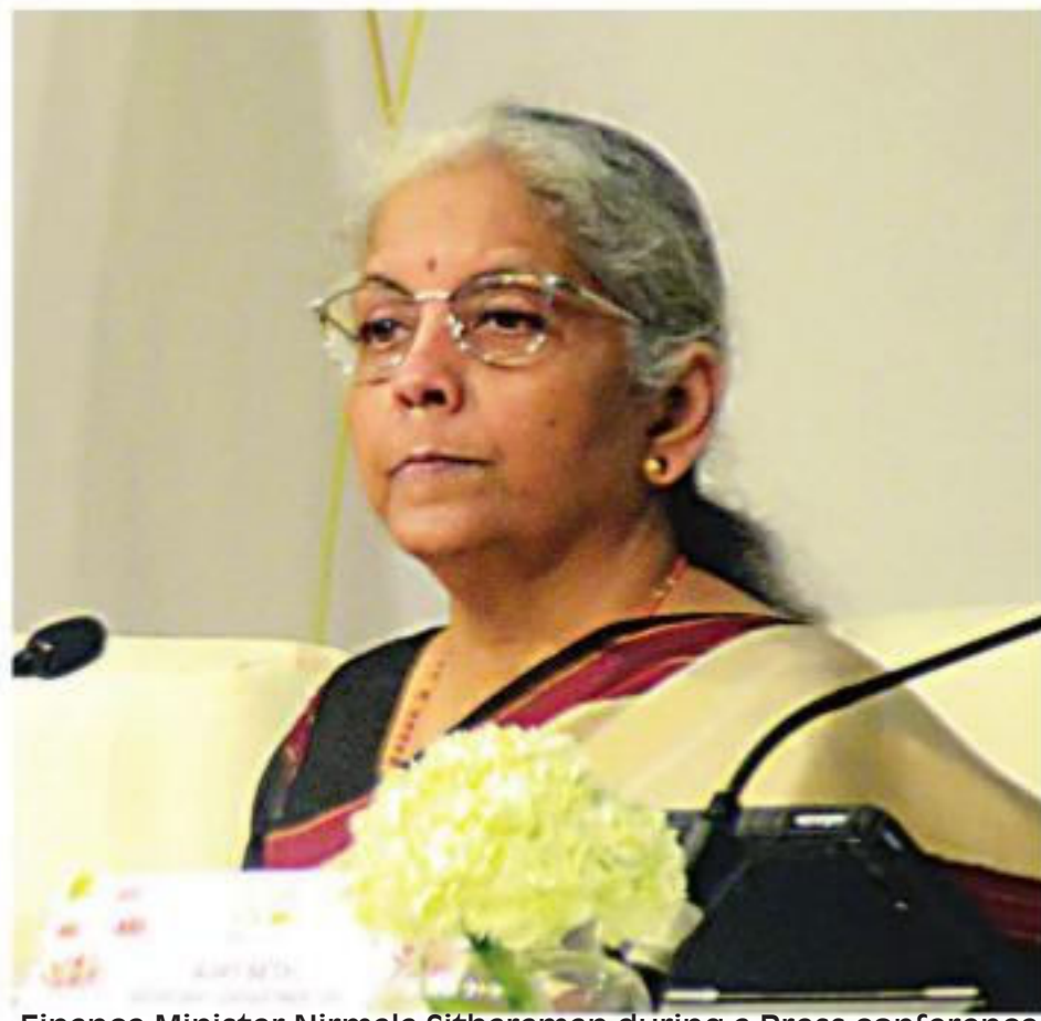
Finance Minister Nirmala Sitharaman during a Press conference at G20 Summit, Pragati Maidan, in the Capital.

The Capital Adequacy Frameworks (CAF) measures, including those under implementation and consideration by G20 countries, could yield additional lending headroom of about $200 billion over the next decade, Finance Minister Nirmala Sitharaman said on Saturday and noted that India has effectively articulated priorities of the Global South in the larger global conversation on the Multilateral Development Bank (MDB) reforms. Addressing a joint press conference after G20 Declaration was adopted, Sitharaman talked about the key achievements of the Indian Presidency in the finance track on Multilateral Development Banks.